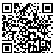
Official Notice Board

NOTICE: When submitting a protest, request or report, the procedure (as set forth in the Racing Rules of Sailing and the Sailing Instructions) remains unchanged.