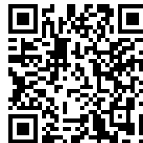
Submit Scoring Inquiry

NOTICE: When submitting a protest, request or report, the procedure (as set forth in the Racing Rules of Sailing and the Sailing Instructions) remains unchanged.